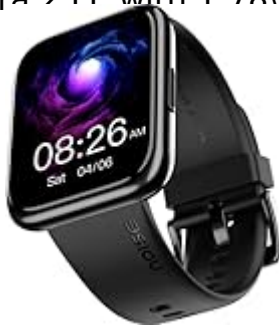
Watch (Jet Black)

Noise ColorFit Ultra 2 LE with 1.78" Always On AMOLED Display, 368x448px (326 PPI) Best in Class Resolution, Quick Replies , SpO2 & 24 * 7 Heart Rate Tracking Smart