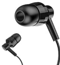
UBON Gp-321 Wired in Ear Earphone with Mic Black