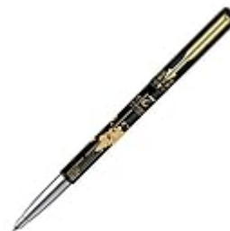
Parker Moments Vector Timecheck Gold Trim Roller Ball Pen (Black)