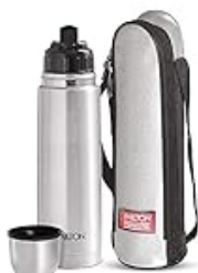
Milton Thermosteel Flip Lid Flask, 500 milliliters, Silver