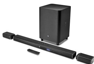
How to set up a Soundbar