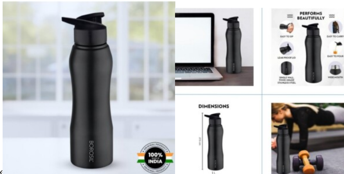
Borosil grip N sip Black