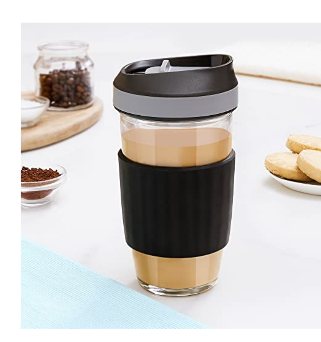
Borosil Trav Sleeve, Bor Mug, 450 m

Brand Material Colour Capacity Theme Included Compone <u>Read More</u> SKU: B0BH47TPR3 Price: ₹1,195.00 O 911.00Current price