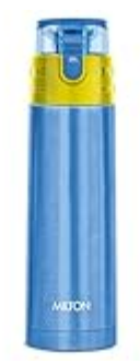
Milton Atlantis 900 Thermosteel Hot and Cold Water Bottle, 750 ml, Blue

Tags: 750 ml , Blue , Milton Atlantis 900 Thermosteel Hot and Cold Water Bottle